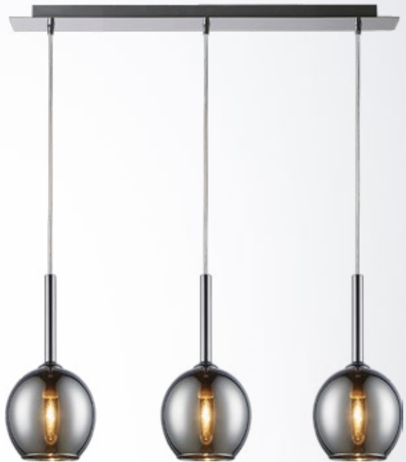
MONIC Pendant lamp MD1629-3A Chrome 3xE14 MAX 40W smoky chrome glass with chrome canopy