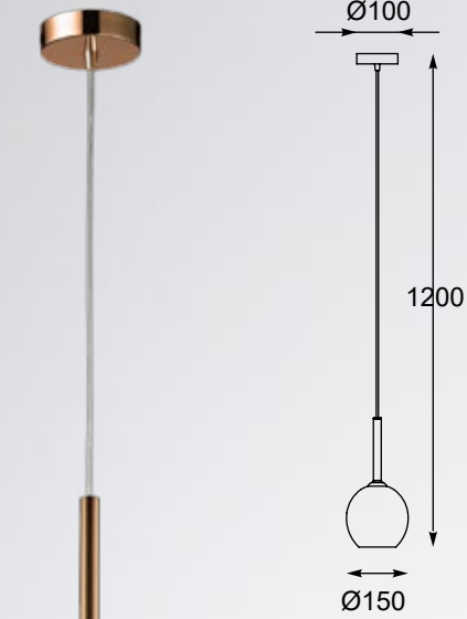
MONIC Pendant lamp MD1629-1 Copper 1xE14 MAX 40W copper glass with copper canopy