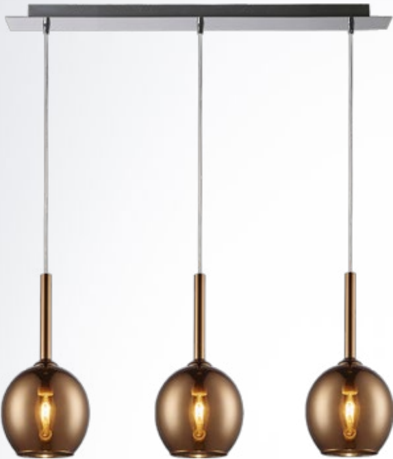
MONIC Pendant lamp MD1629-3A Copper 3xE14 MAX 40W copper glass with chrome canopy